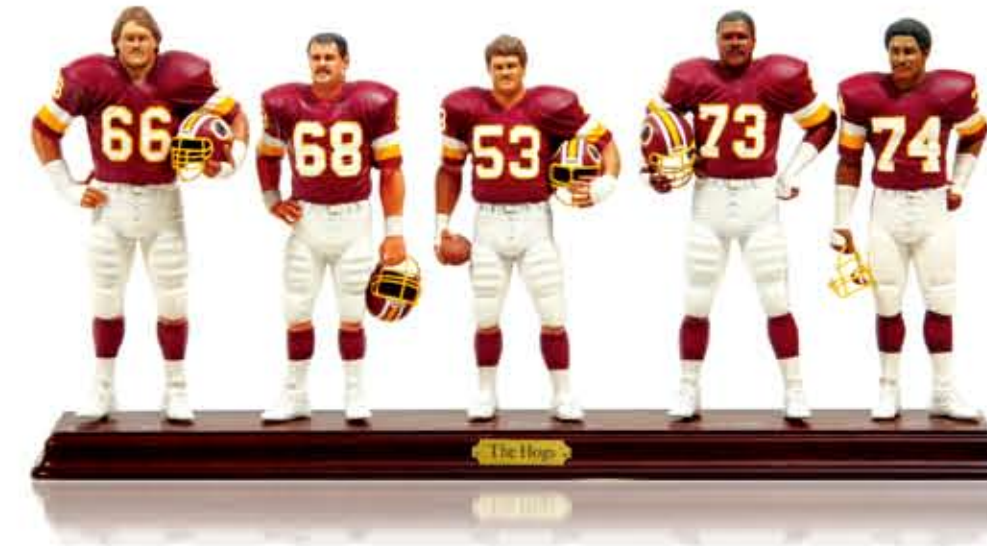
(Preceding page) Gibbs was the man of the hour after coaching the Redskins to their first Super Bowl win in just his second season. (Below) Jacoby (66) and Russ Grimm (68) were part of a monster offensive line nicknamed "The Hogs" (right), which helped open holes for Riggins and others. Like "The Hogs" stars Darrell Green (28) and Monk (81) were huge fan favorites.

After a 14-2 regular season, a 51-7 demolition of the Rams in the first round of the playoffs and a 24-21 win over the 49ers in the NFC Championship game, the Redskins were primed to go down as one of the greatest teams in NFL history. Gibbs has long said that the 1983 squad was his most talented team.